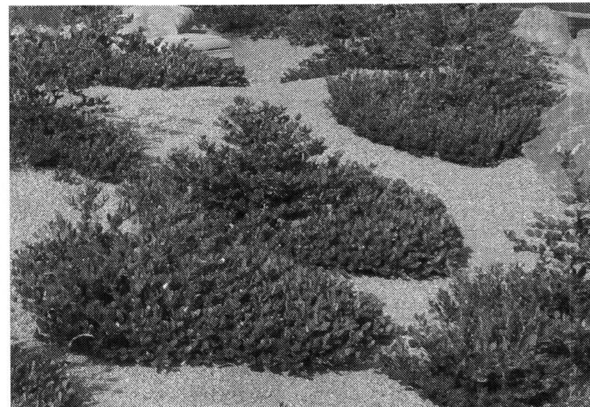
CARISSA 'GREEN CARPET'