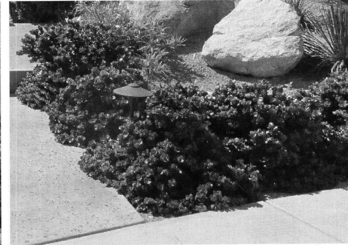
CARISSA 'BOXWOOD BEAUTY'