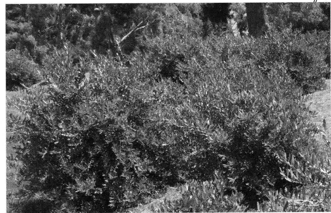
LITTLE OLLIE DWARF OLIVE